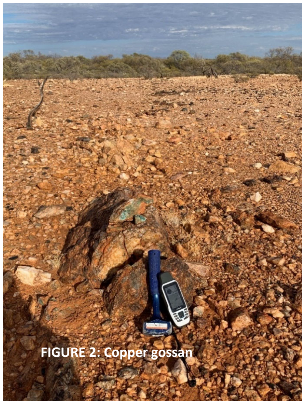
FIGURE 2: Copper gossan