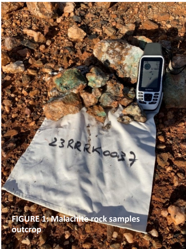
FIGURE 1: Malachite rock samples outcrop