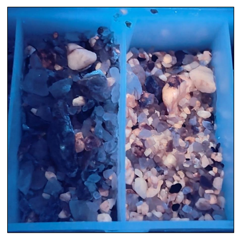
Figure 2. NT Lithium Project - Samples 2318-30 and 31 under UV light in drillhole 23RC018