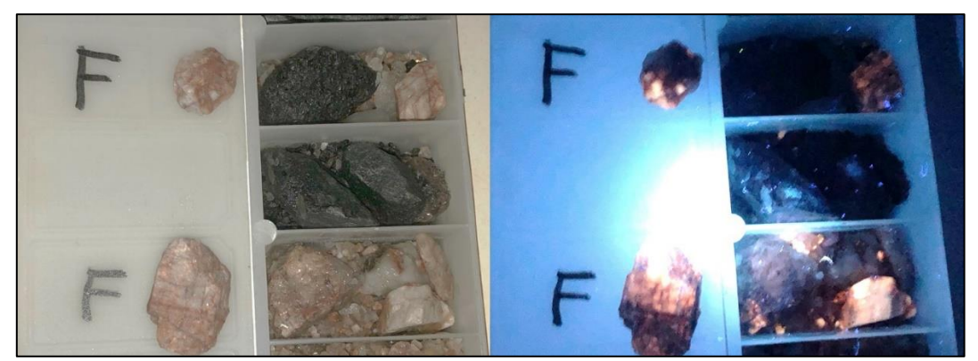
Figure 1. NT Lithium Project - Samples 75 to 77 in drillhole 23RC018