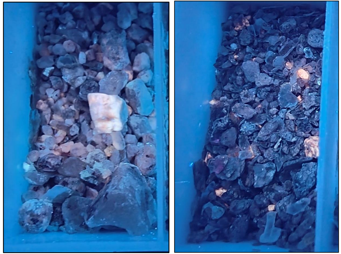
Figures 3-4. NT Lithium Project - Sample 2313-06 from 23RC013 (L) and Sample 2312-71 from 23RC012 under UV light

The Company is encouraged by the results so far and waits for confirmation of spodumene bearing pegmatite in assay results.