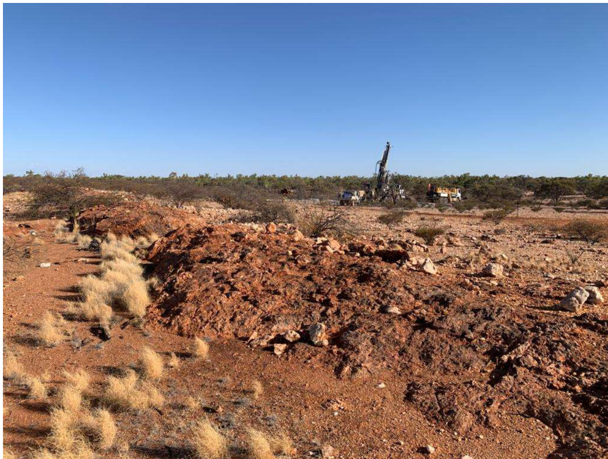
Figure 1: Peggy Sue pegmatite outcrop at the Morrissey Hill Lithium Project, with Strike Drilling RC drill rig at work testing its subsurface continuity.