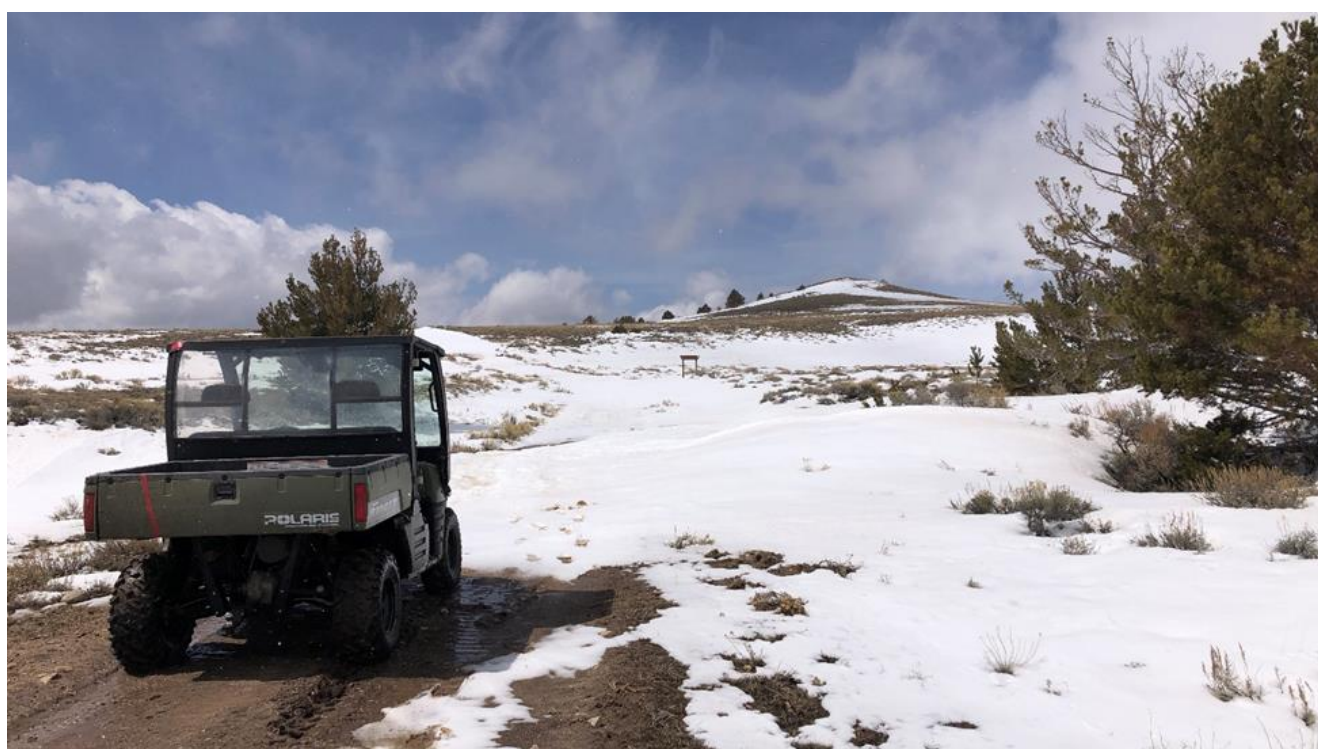
FIGURE 2. GREEN MOUNTAIN PROJECT DRILL SITE ACCESS REVIEW IN APRIL 2024

The final on-site review of drill site access was completed in mid-April, the earliest the weather conditions would allow. The Drilling Notification paperwork has been lodged and GTI will consider a final decision to proceed with the Green Mountain drill program once reclamation bonding is approved by Wyoming’s DEQ & the Federal BLM.