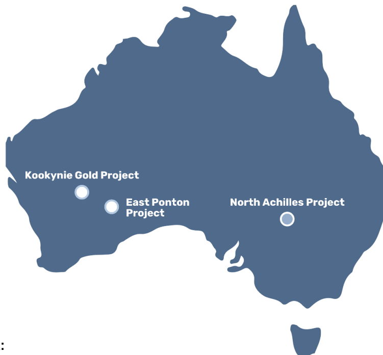
Figure A: Regener8 Exploration Portfolio Project Locations

Sitting within the Kookynie Gold district north of Kalgoorlie, the project hosts substantial historical workings and exploration with intersections including 2m @ 70.5 g/t Au (RC38), 2m @ 15.4 g/t Au (RC315) and 2m @ 11.32 g/t Au (RC391). Regener8's 2023 program found encouraging results which included 5m @ 3.18 g/t Au (NGRC017) and 2m @ 7.77g/t Au (including 1m @ 14.8 g/t Au in NGRC037).