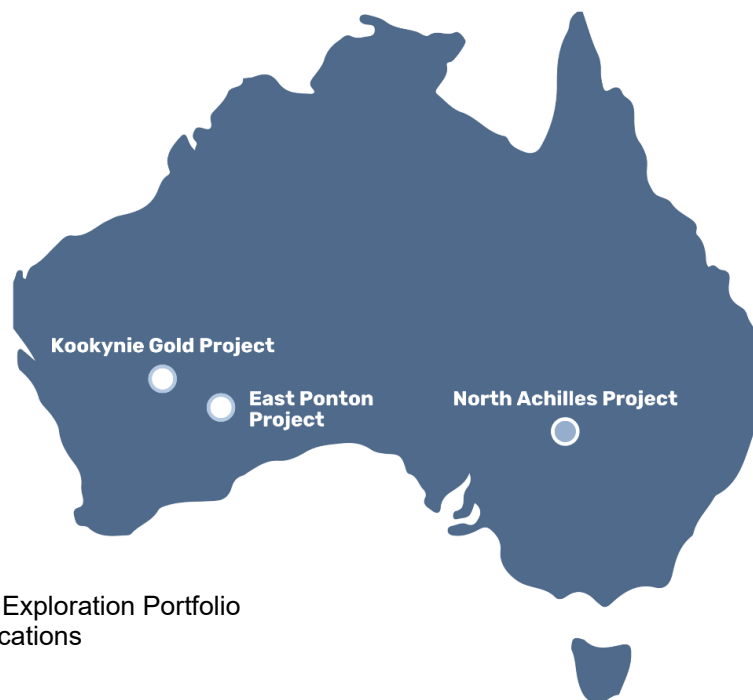
Figure A: Regener8 Exploration Portfolio Project Locations

Sitting within the Kookynie Gold district north of Kalgoorlie, the project hosts substantial historical workings and exploration with intersections including 2m @ 70.5 g/t Au (RC38), 2m @ 15.4 g/t Au (RC315) and 2m @ 11.32 g/t Au (RC391). Regener8's 2023 program found encouraging results which included 5m @ 3.18 g/t Au (NGRC017) and 2m @ 7.77g/t Au (including 1m @ 14.8 g/t Au in NGRC037).