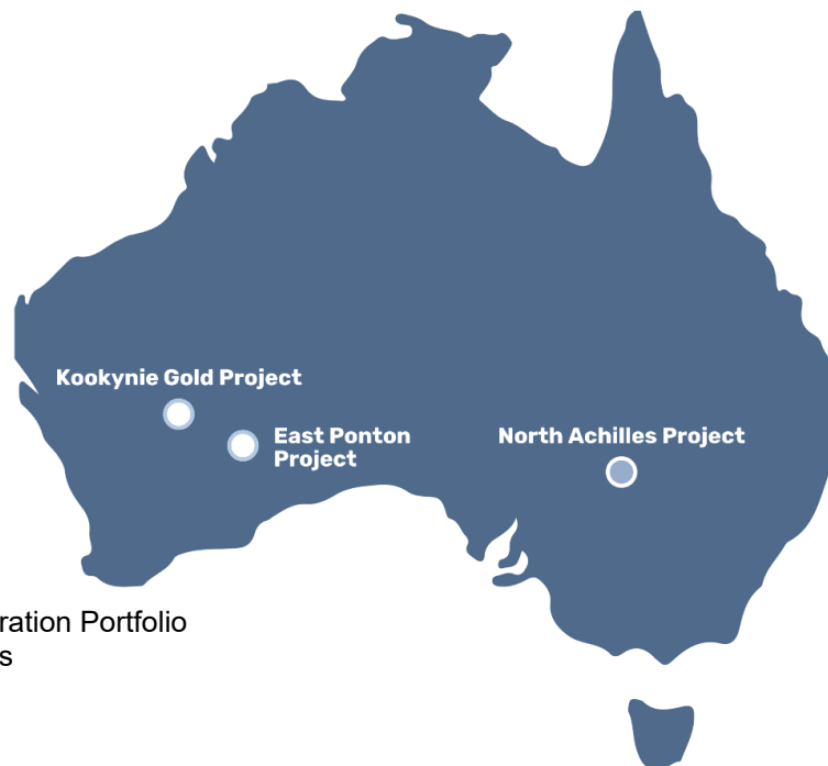
Figure A: Regener8 Exploration Portfolio Project Locations

Sitting within the Kookynie Gold district north of Kalgoorlie, the project hosts substantial historical workings and exploration with intersections including 2m @ 70.5 g/t Au (RC38), 2m @ 15.4 g/t Au (RC315) and 2m @ 11.32 g/t Au (RC391). Regener8's 2023 program found encouraging results which included 5m @ 3.18 g/t Au (NGRC017) and 2m @ 7.77g/t Au (including 1m @ 14.8 g/t Au in NGRC037).