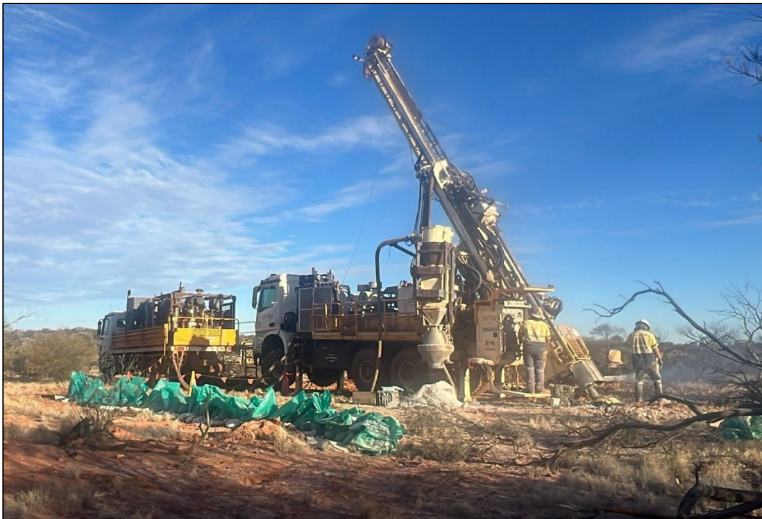
Figure 1. Strike Drilling RC rig at Leinster South

Metal Hawk Limited (ASX: MHK, “Metal Hawk” or the “Company”) is pleased to announce that reverse circulation (RC) drilling has commenced at its 100% owned Leinster South Project, located in the Agnew-Lawlers region, Western Australia.