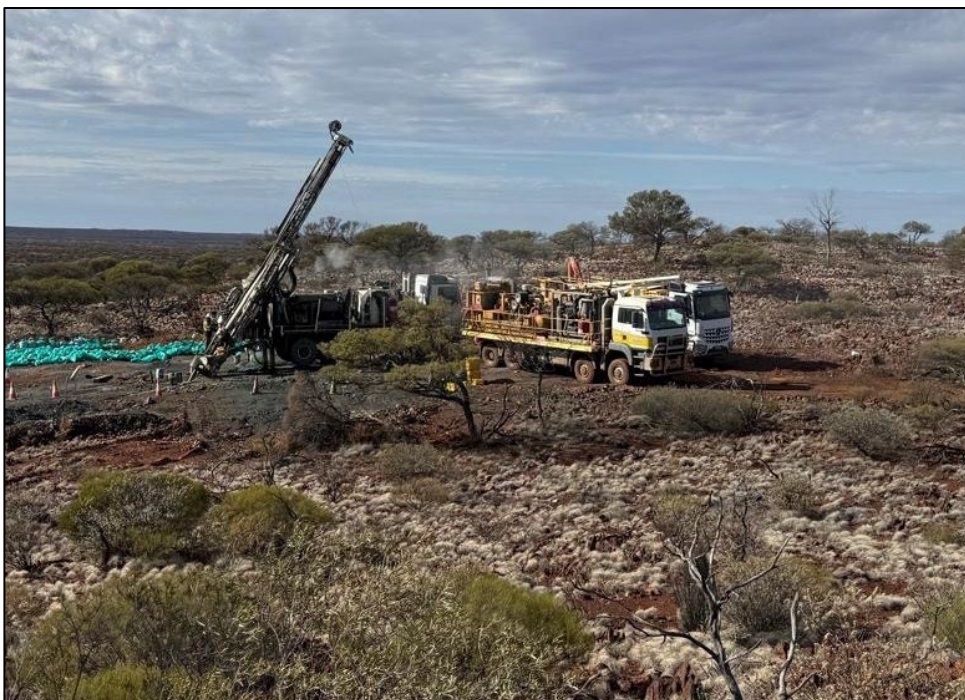
Figure 1. Strike Drilling RC rig at Leinster South

The drilling program tested along the granite-greenstone contact and prospective gold corridor extending for more than 1km north from Tysons prospect and included the priority SAM target. Additional follow-up holes were completed at the eastern portion of the Thylacine prospect. The Company will schedule follow-up work following receipt of initial assay results which are due in the next 3-4 weeks.