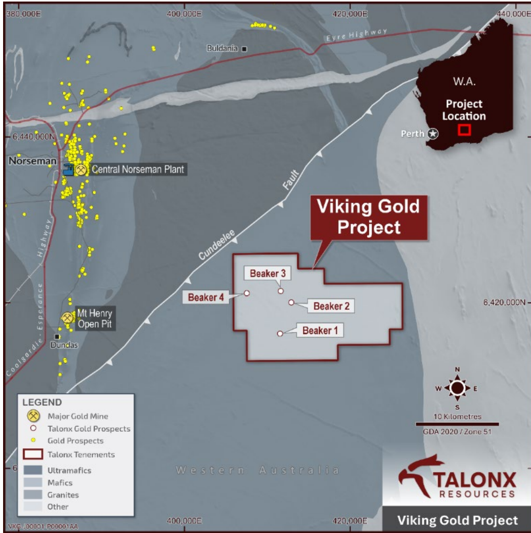
Figure 3. Viking Gold Project location