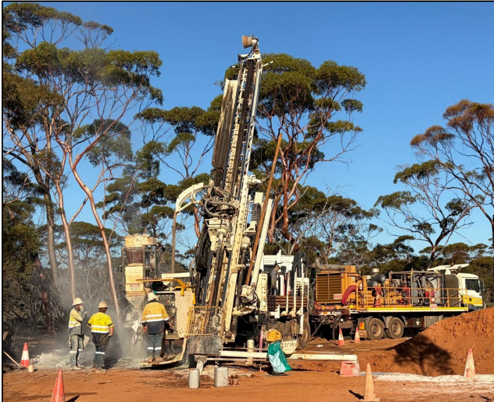
Figure 1. RC drilling at Beaker 2